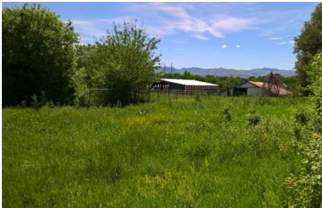
Figure 5. Proposed Planning Areas P-1 and P-2 6505 S. Santa Fe Drive, facing southwest towards the property's accessory structures