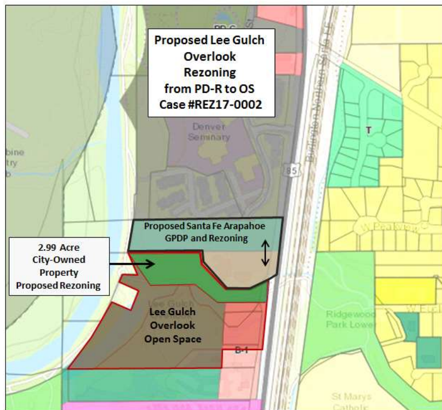
Figure 6. Location of city-owned open space property, proposed for rezoning

Section 10-2-23 (A) of the city's zoning ordinance states that The Planned Development (PD) District is hereby created to promote the public health, safety and general welfare by allowing more flexible development, based upon a comprehensive, integrated plan.