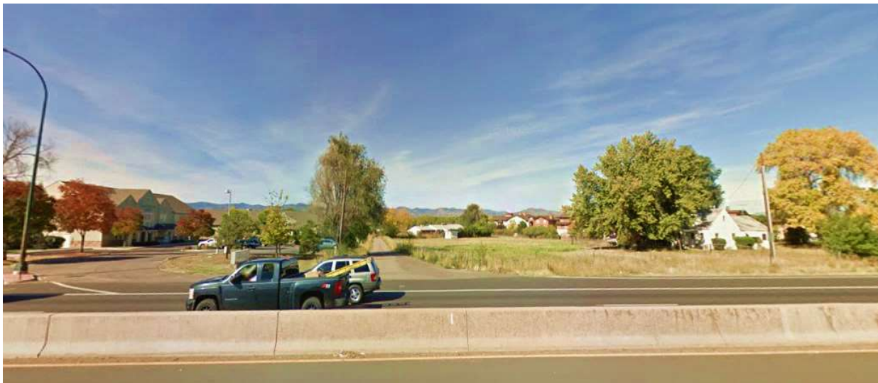
Figure 3. 6507-09 AMHC) left and 6505 (Sutton Property) right From South Santa Fe Drive