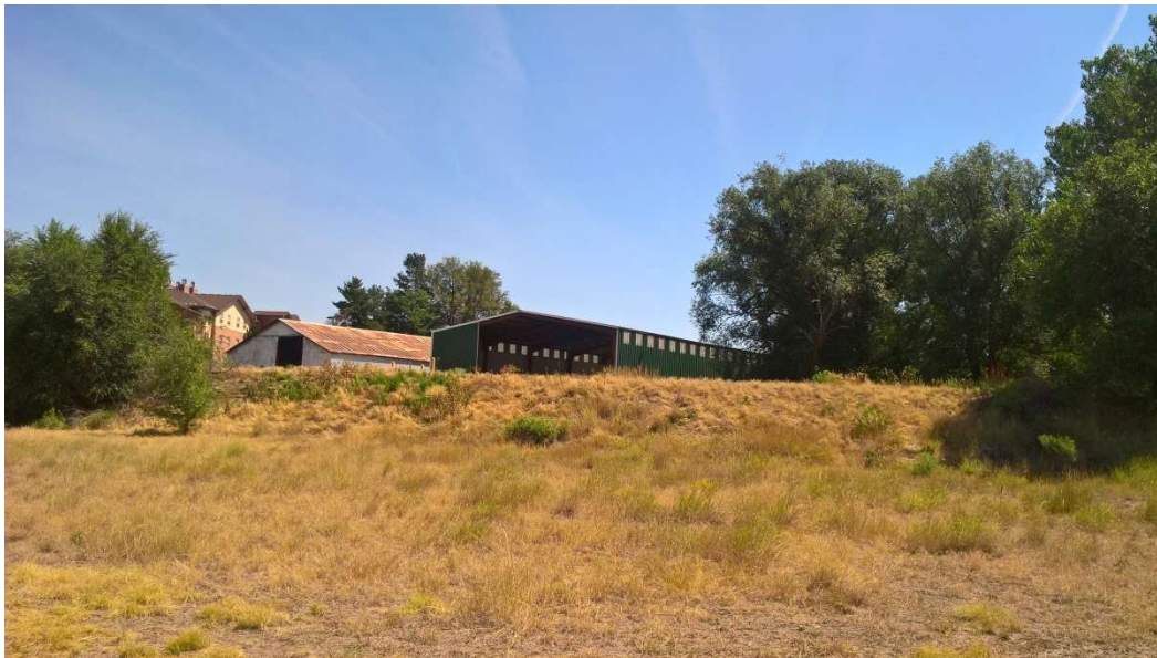
Figure 4. 6505 S. Santa Fe, view from Mary Carter Greenway