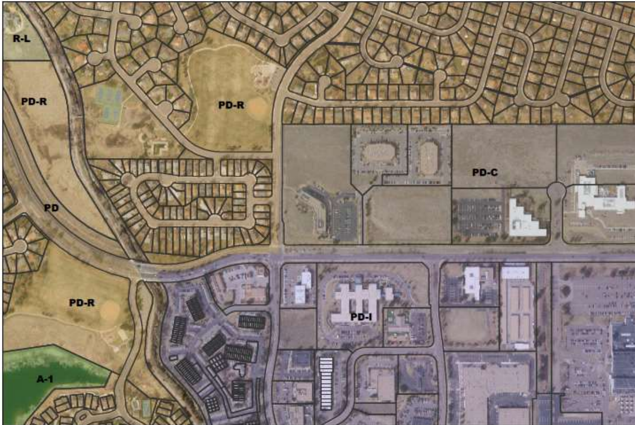
Zoning and Vicinity Map