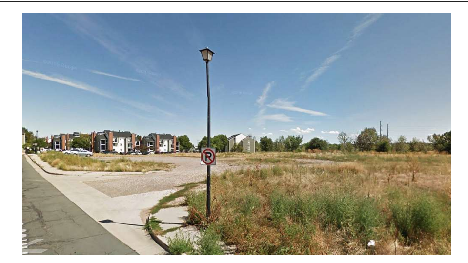
Figure 2. Street View of Subject Property with Riverside Apartments in the Background