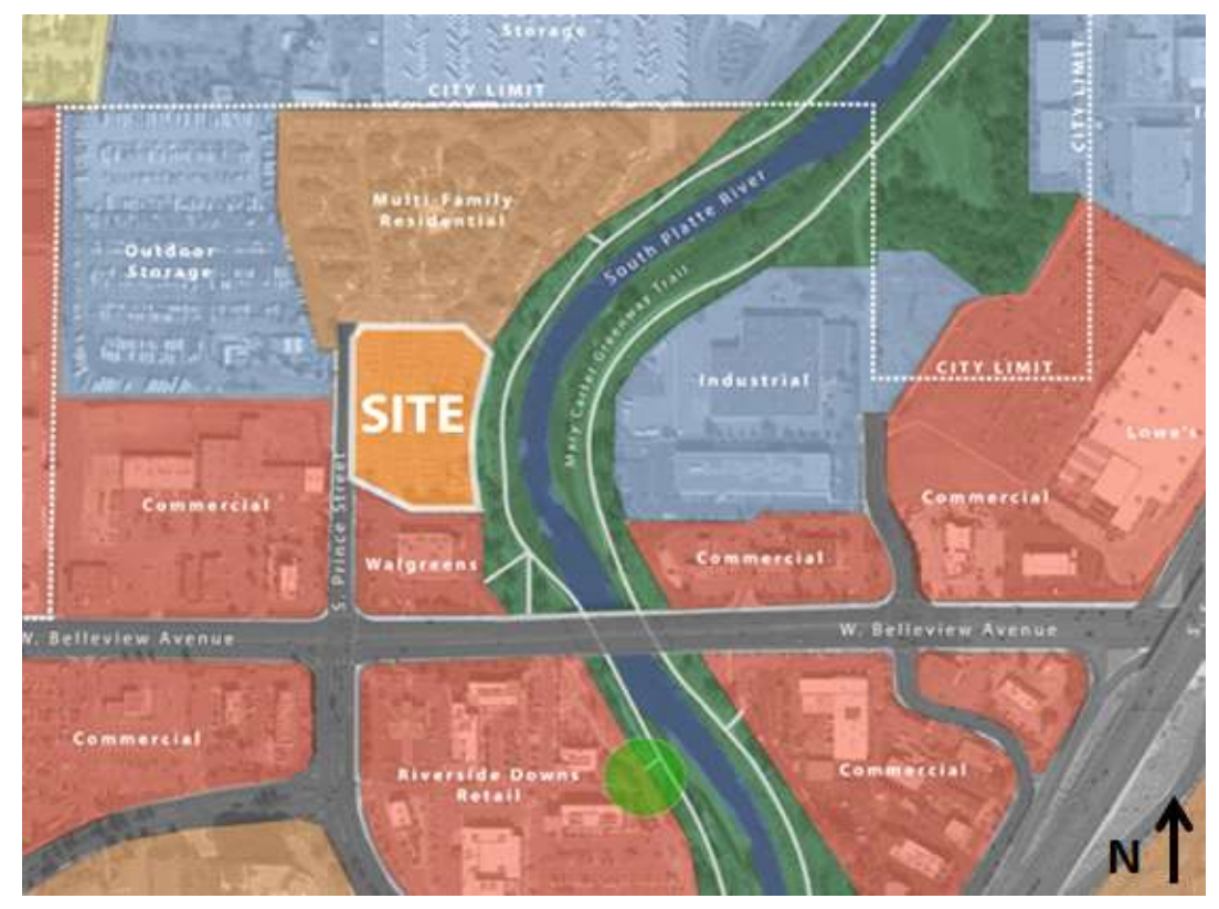
Figure 1. Vicinity Map

The site is located near the intersection of West Belleview Avenue and South Prince Street, north of the Walgreens Pharmacy and south of the Riverside Apartments.