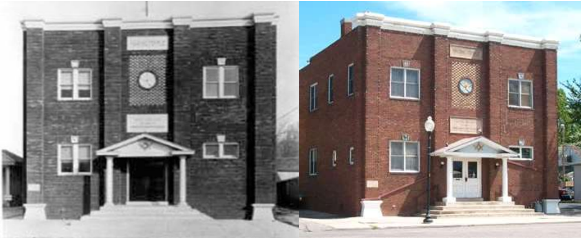
Historic and recent photos of the Weston Masonic Lodge