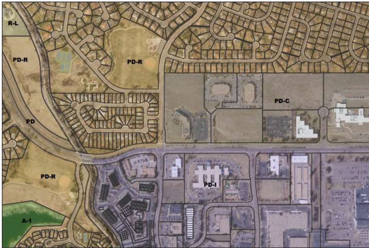
Zoning and Vicinity Map