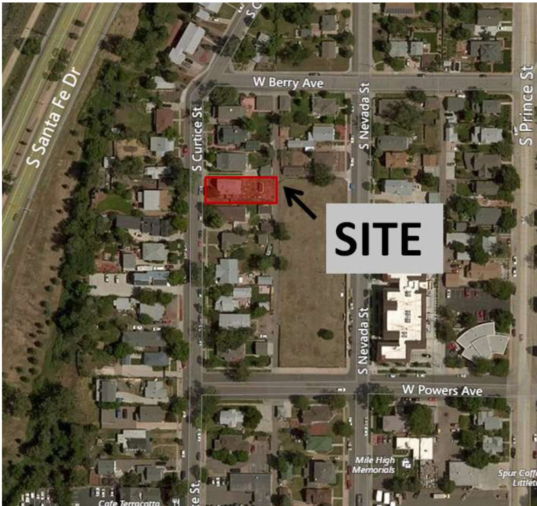
Figure 1 Vicinity Map