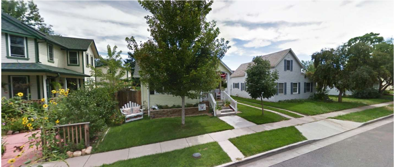
Figure 2. Street View of 5500 Block of South Curtice Street Facing South

The subject property is on South Curtice Street between West Powers Street and West Berry Avenue South Sycamore Street within a residential neighborhood north of Main Street, as shown in the vicinity map in Figure 1. Street views of the block face are shown in Figures 2 and 3.