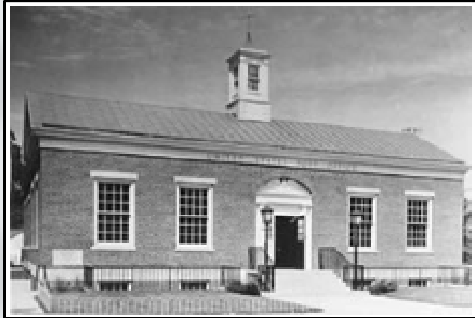
Original 1939 BUILDING