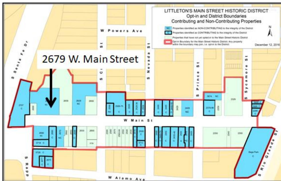
Figure 2. Map of Main Street Historic District