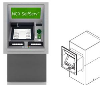
Proposed ATM model

Excerpt from Sheet 23 of the attached plan set