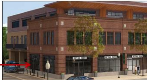
Littleton Mixed Use View of the West and South Elevations