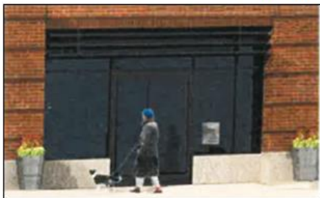
Storefront Rendering With Deposit Box