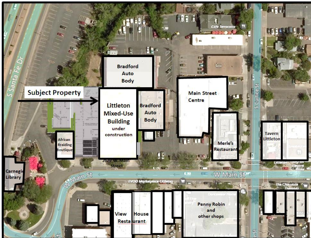
Figure 1. Vicinity Map