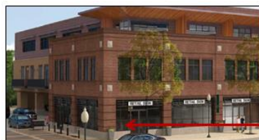
Littleton Mixed Use View of the West and South Elevations

Installation of an ATM in the street-facing storefront as shown below. The face of the machine as it sits in the window is 28" x 33". The fascia will be flush with the storefront glass and the work space is recessed into the building. The machine includes backlit areas for the touch monitor and other features. Information on ATM's, including bank logos, is not considered signage regulated under the city sign code.