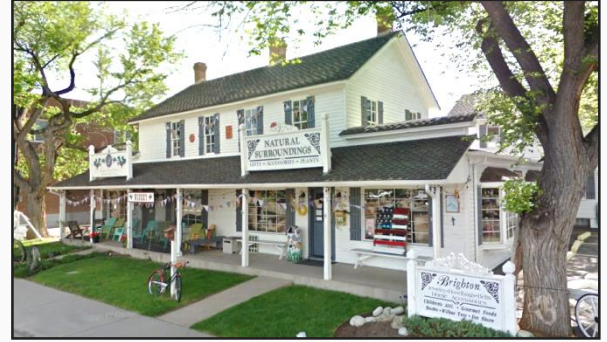
J.D. Hill General Store 5728-38 S. Rapp Street