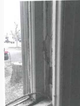
One of 12 windows Needing restoration work