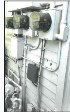
Electrical Boxes at rear