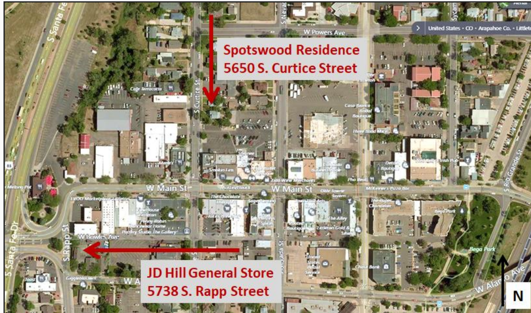
Location of Spotswood Residence and the JD Hill General Store