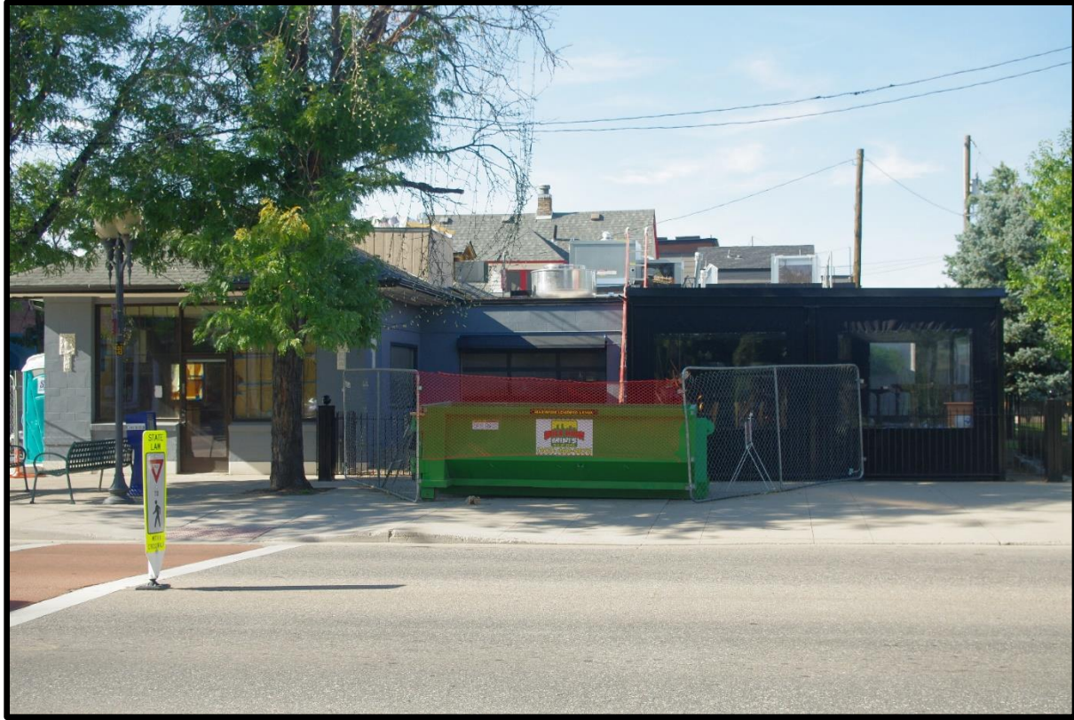
08/14/2016 Rooftop equipment and venting is being installed.