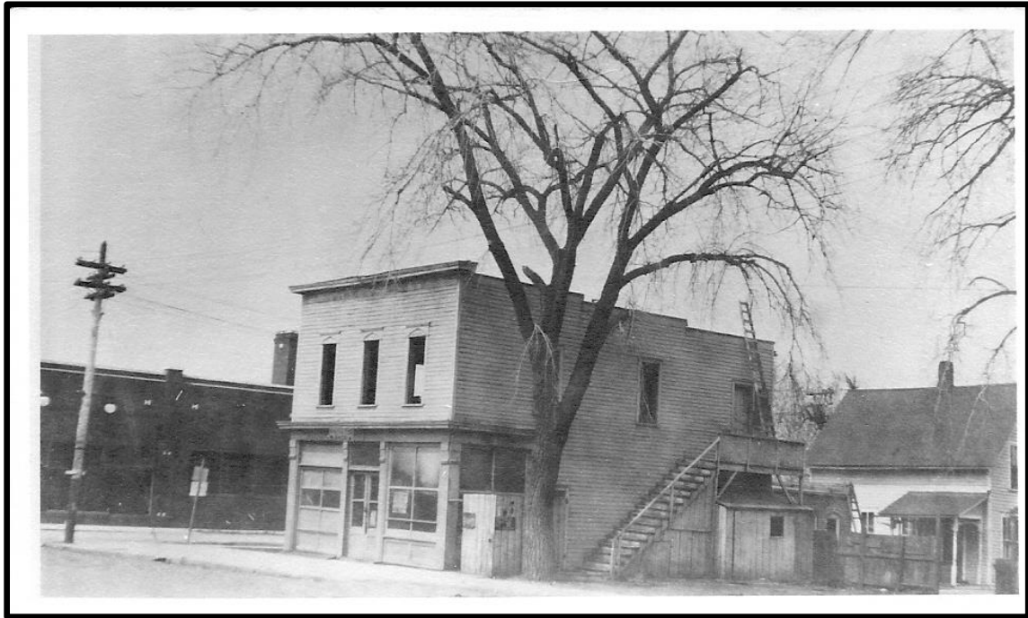
The Last Chance Saloon, at the northeast corner of Main and Sycamore Streets, was demolished and replaced by the Sommers Oil Service Station