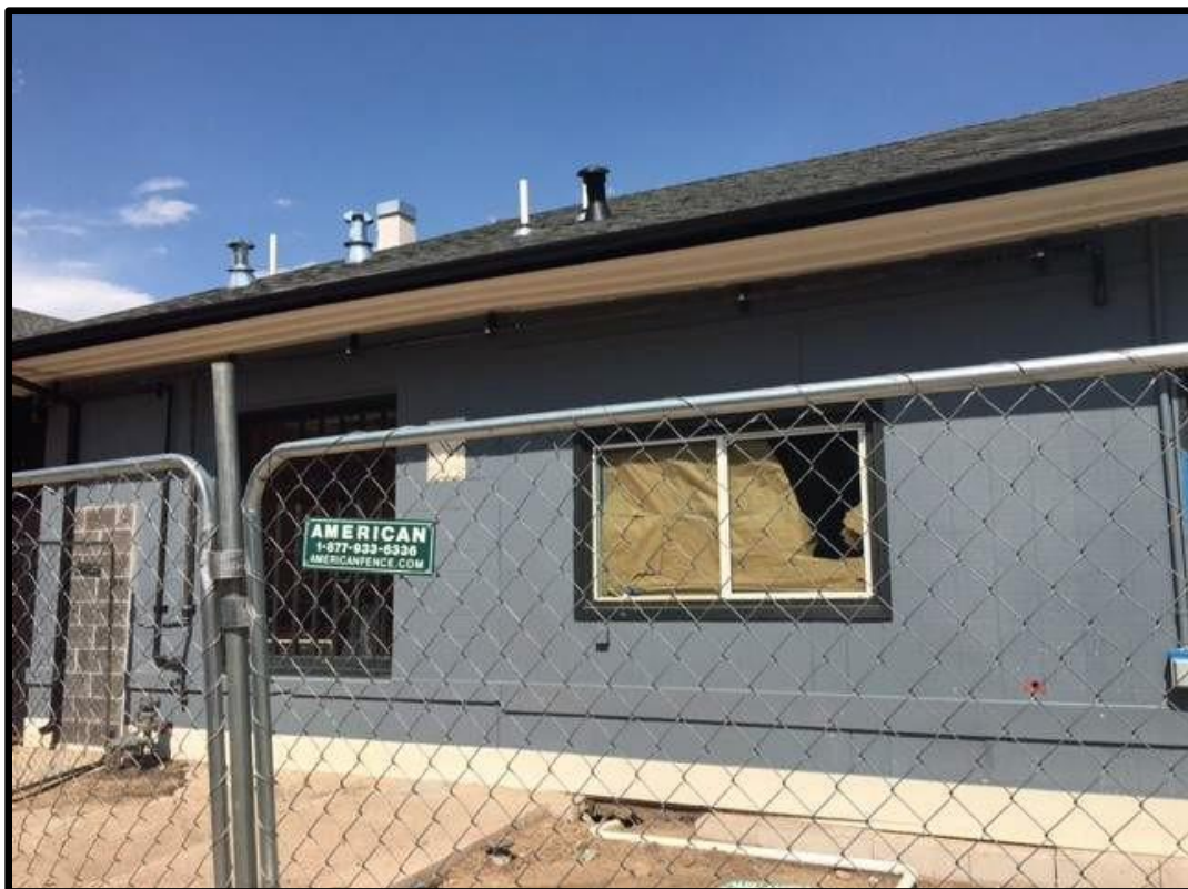
8/16/2016 The doorway was blocked, but is not yet painted. The gas lines were moved and painted black. The existing gas line on the west side of the building was moved up toward the soffit to hide it and make it less visible.