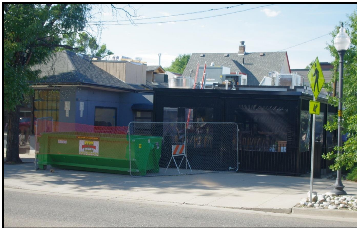
8/16/2016 Roof top HVAC equipment, including a new gable end dormer, with the duct, roof vent enclosure, and the platform for the large kitchen vent in process of being constructed,