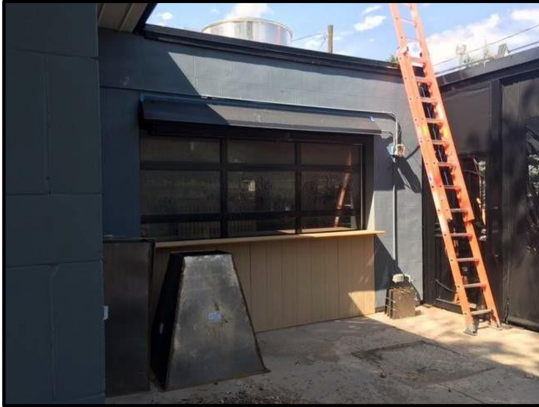
8/16/2016 The new patio bar is on the exterior of the building and will have a white quartz countertop. Staff recommends moving the bar back to the interior of the building to allow the existing garage door to close.