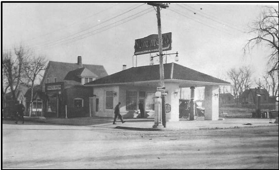
The original Sommers Service Station and the Franzen Grocery store, projecting out from the north side of the service station, prior to the addition of the garages to the east of the original service station and the enclosure of the drive-through canopy. Note the smaller door on the north end of the west wall; that door is now blocked up.