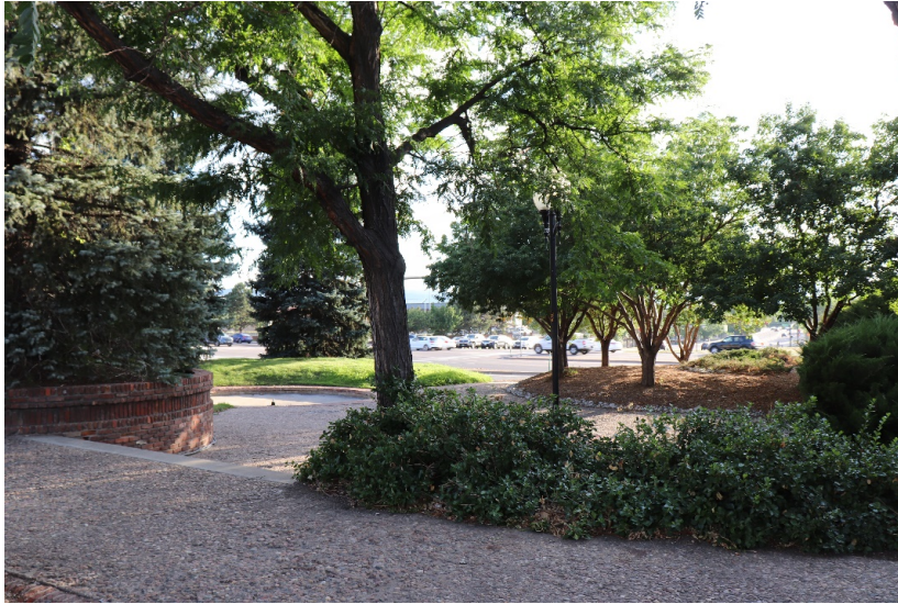
Figure 3.2: Bowles Park in relation to Carnegie Library