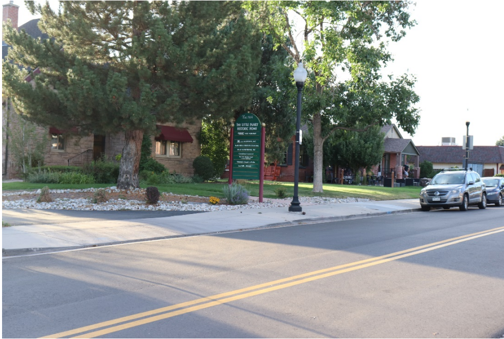
Figure 2.2: Character of 5767 S Rapp St and 5757 S Rapp St