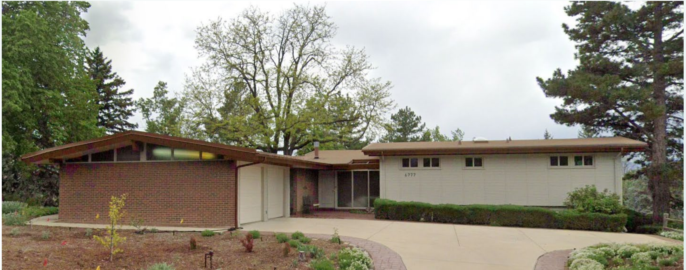
View of the front façade of the home from Southridge Lane looking to the southwest