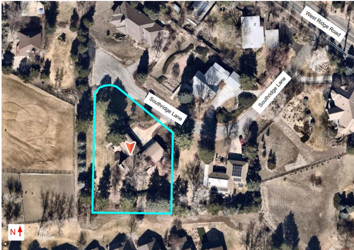
Figure 1: 6777 Southridge Lane outlined in blue