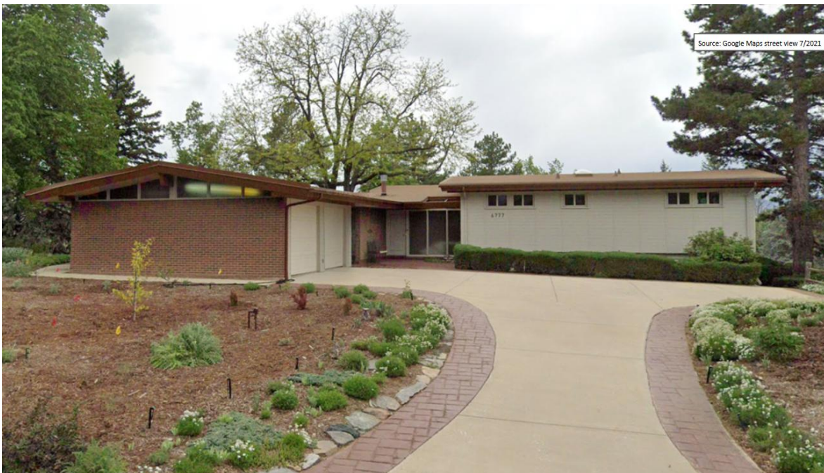
Figure 3: View of the front façade of the home from Southridge Lane looking to the southwest

The Pray-Parsons House is located at 6777 Southridge Lane in Littleton, within Arapahoe County. The Modern Movements home incorporates Usonian design elements and was constructed in 1962. The house sits on a small cul-de-sac in the Barts Brae subdivision. Architect Bruce Sutherland designed the house and worked with builder Clyde Mannon on the property. The spacious house is virtually unaltered, in pristine condition, and spans 3,820 square feet. The expansive 0.62-acre lot features not only mature landscaping (grass lawns, a mixture of deciduous and evergreen trees, and multiple large flower beds) but also stunning views of the Front Range mountains. The name Pray-Parsons House refers to the only two families who have owned and resided in the home over its sixty-three-year history.