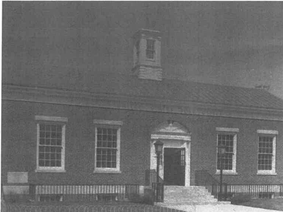
HP2 Littleton Post Office. East side. Historic photo ca 1940-1950. View to west.