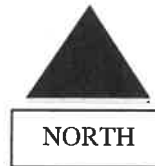
Sketch Map – Littleton Post Office