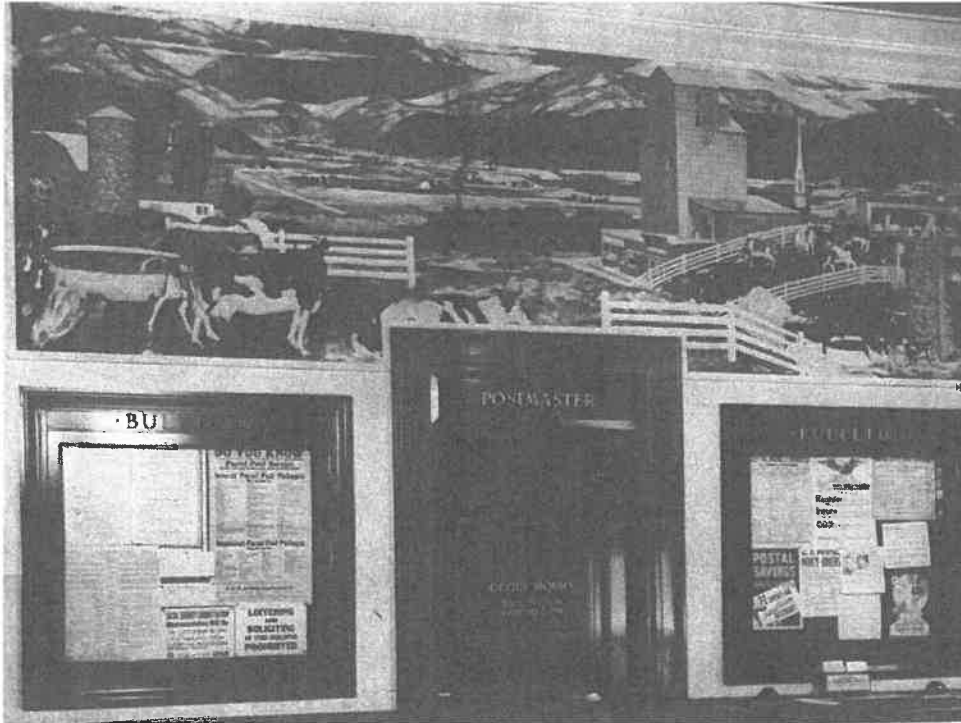
HP4 Littleton Post Office interior showing mural. Historic photo ca 1948.