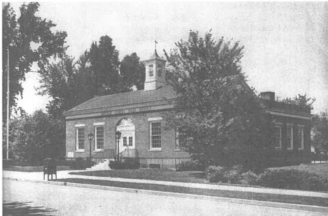
HP1 Littleton Post Office. East and north sides. Historic photo ca. 1948. View to southwest.