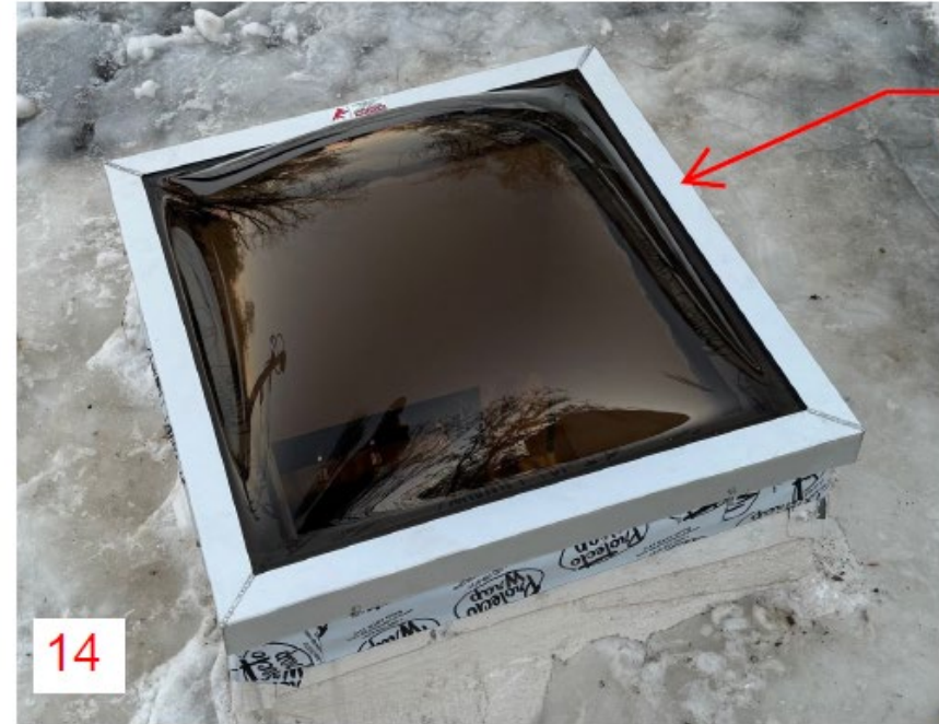
NEW SKYLIGHT FROM EXTERIOR