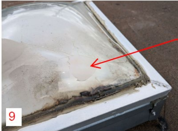
EXISTING BROKEN SKYLIGHT