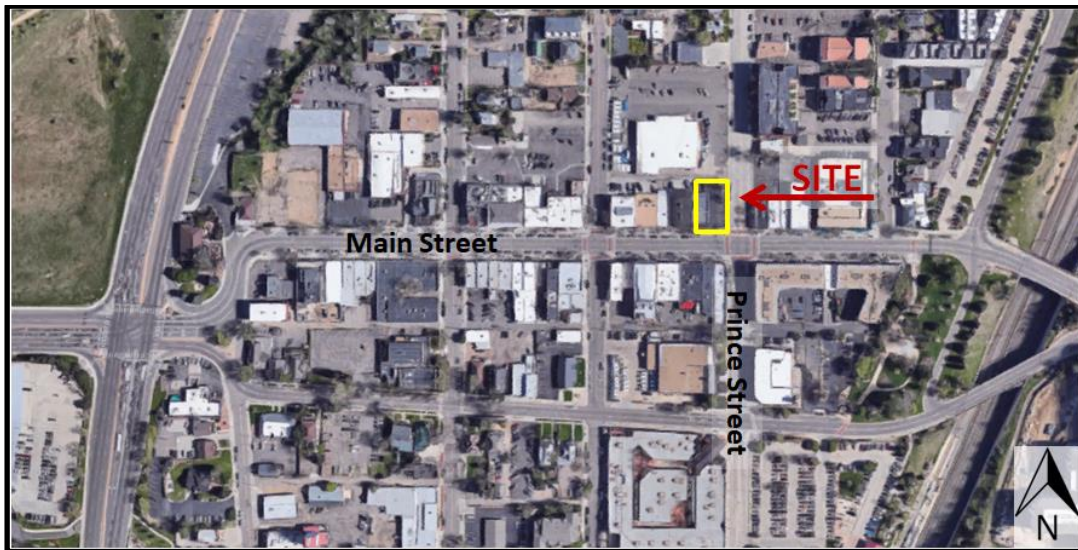
Vicinity Map Van Schaak & Company Building – 2409 W. Main Street

The vicinity map below shows the location of the application.