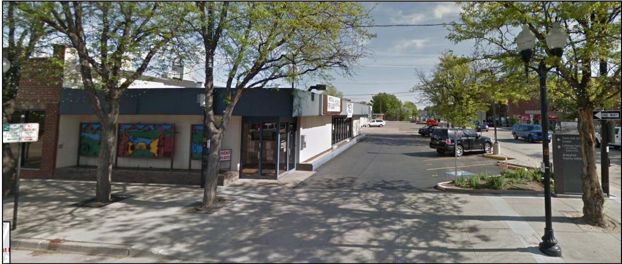
The Van Schaak & Company Building