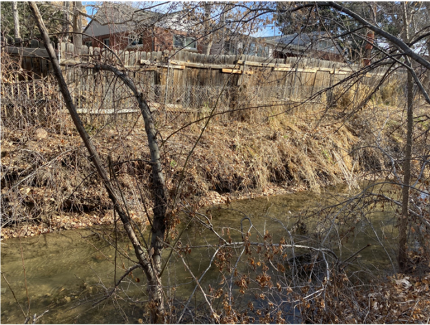
PHOTO – EXISTING BANK SOUTH AREA