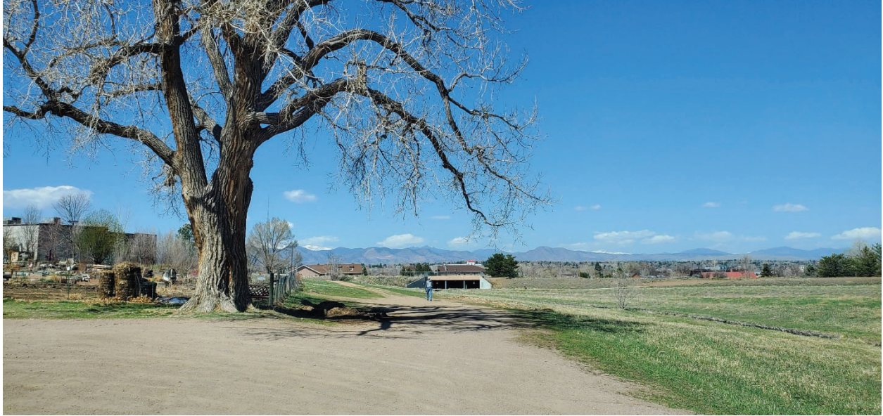
Photo 5- Possible formalized trail connecting Sterne Park to Littleton Community Trail