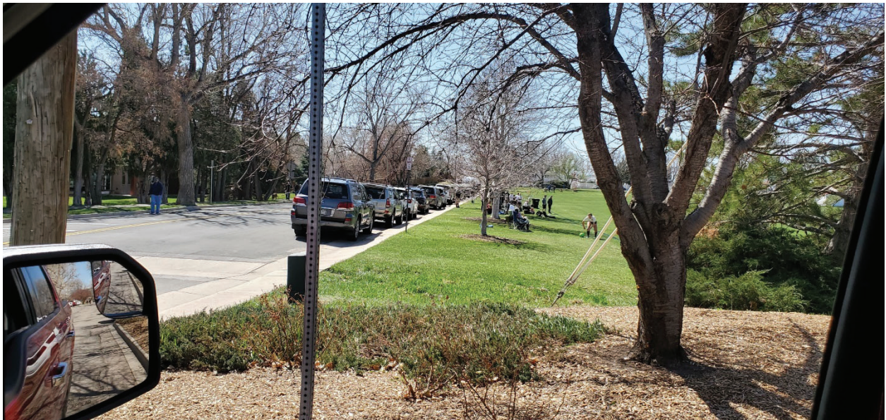
Photo 6- Possible walk widening to provide accessibility into playfields at Gallup Park