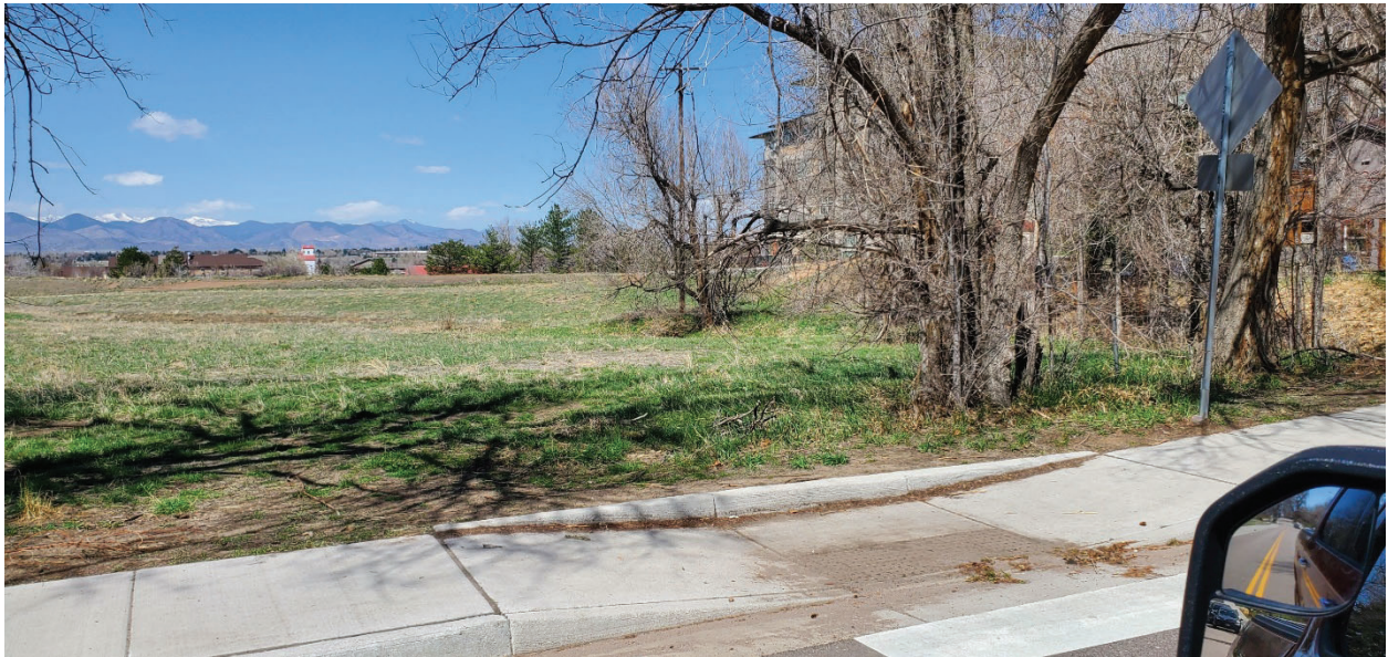
Photo 4- Possible trail connection along north side of Sterne Park