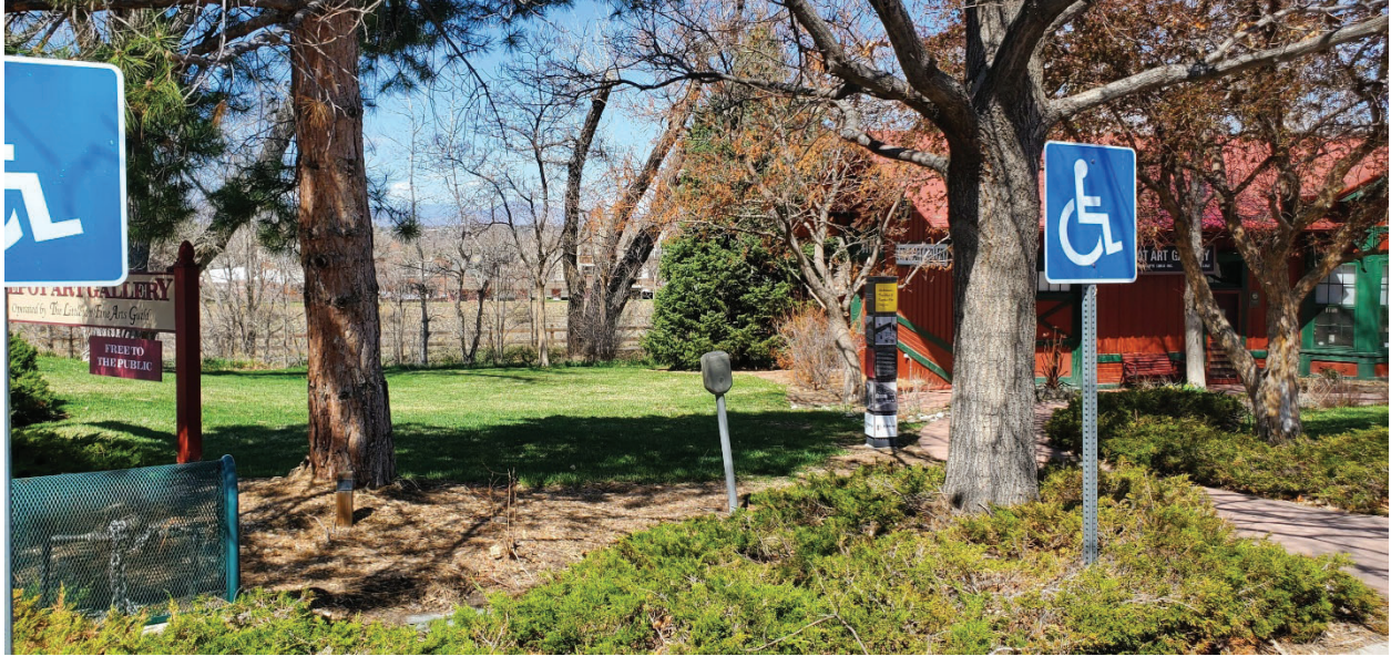
Photo 3- Possible trail connection to Littleton Community Trail with wayfinding near Depot