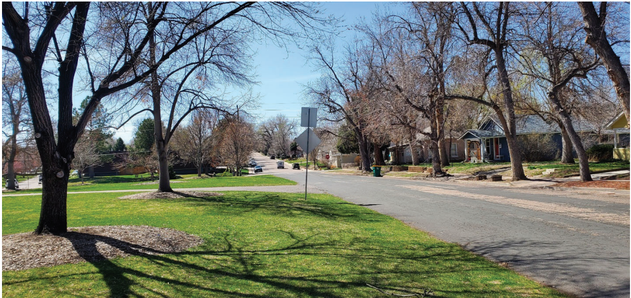
Photo 2- Possible location of trail connection into Sterne Park along Spottswood St.