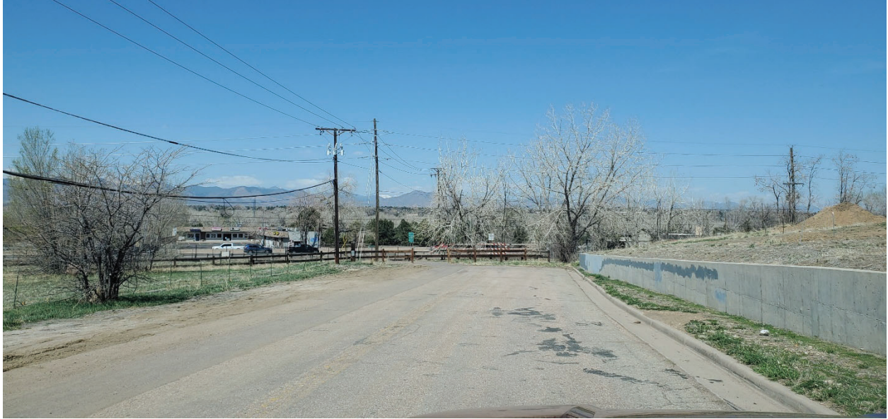
Photo 1- Possible trail connection and trailhead to Littleton Community Trail (off Ridge Road)