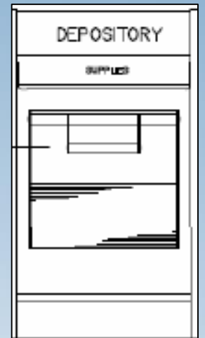
Deposit Box Model