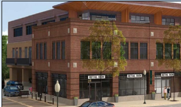
Littleton Mixed Use