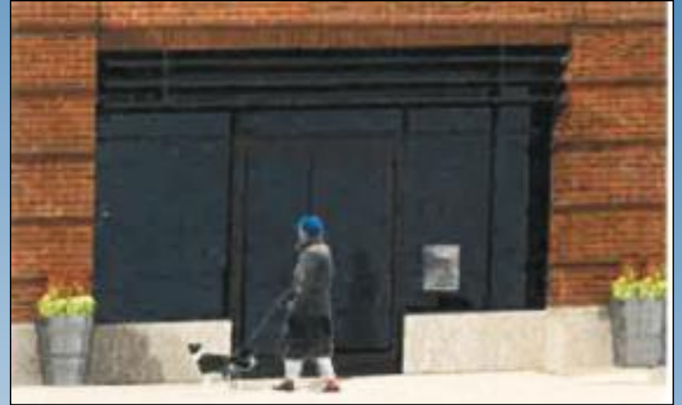
Storefront Rendering With Deposit Box