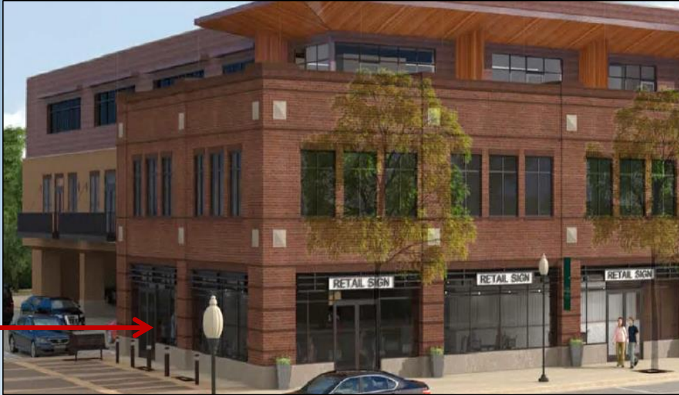
Littleton Mixed Use View of the West and South Elevations